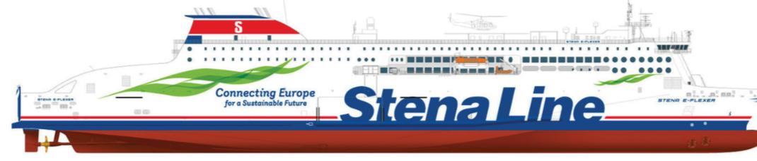
STENA EDDA (2020)

W0264 - LOA 214.5m - Pax 927 - Cabins 175 Lane metres 3,100 - LNG ready - Scrubber ready