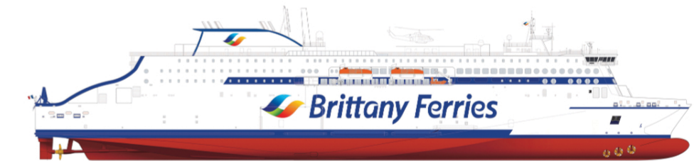
GUILLAUME DE NORMANDIE (2025)

W0278 - LOA 194.7m - Pax 1,290 - Cabins 387 Lane metres 1,143m trailers (+1,392Lm cars) Hybrid LNG Electric