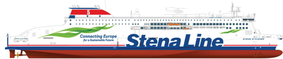
STENA ESTRID (2019)

W0263 - LOA 214.5m - Pax 927 - Cabins 175 Lane metres 3,100 - LNG ready - Scrubber ready