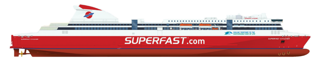
ATTICA GROUP TBN (2027)

LOA 240m - Pax 1,500 - Cabins 256 Lane metres 3,320 - Multifuel - Methanol-ready