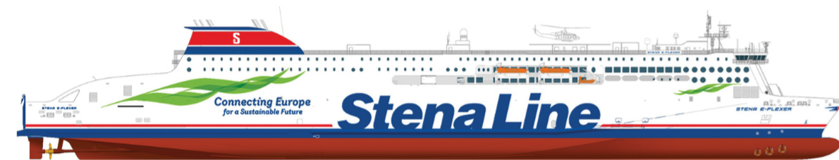
STENA ESTELLE (2022)

W0269 - LOA 214.5m - Pax 1,015 - Cabins 341 Lane metres 2,714 - LNG