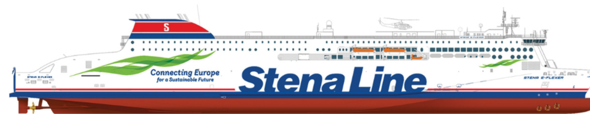
STENA EBBA (2022)

W0270 - LOA 240m - Pax 1,200 - Cabins 263 Lane metres 3,587