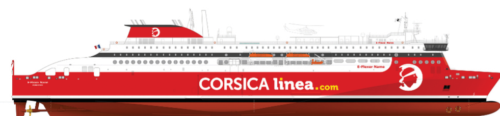
CORSICA LINEA TBN (2026)

W0275 - LOA 194.7m - Pax 1,310 - Cabins 222 Lane metres 2,219m trailers (+176Lm cars) Hybrid LNG Electric