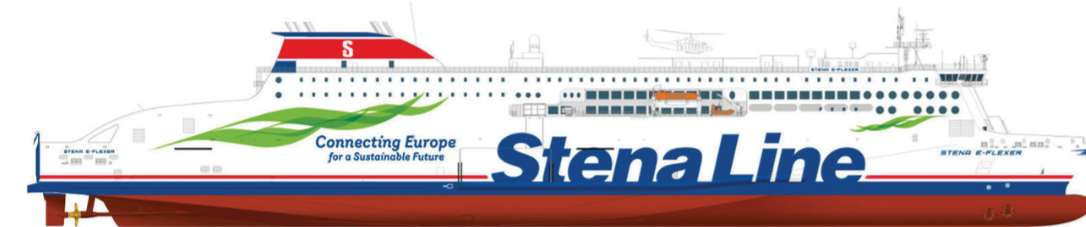
STENA EMBLA (2020)

W0267 - LOA 214.5m - Pax 1,015 - Cabins 340 Lane metres 3,054 - Scrubber