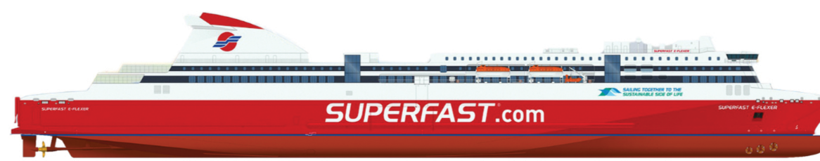
ATTICA GROUP TBN (2027)

LOA 203m - Pax 1,000 - Cabins 235 Lane metres 2,500 - Battery Hybrid LNG