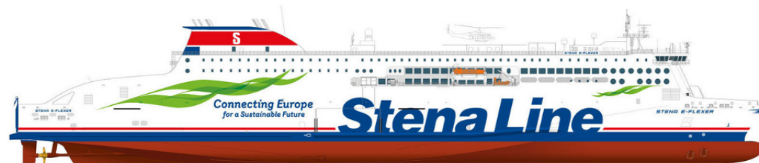
STENA EDDA (2020)

W0264 - LOA 214.5m - Pax 927 - Cabins 175 Lane metres 3,100 - LNG ready - Scrubber ready