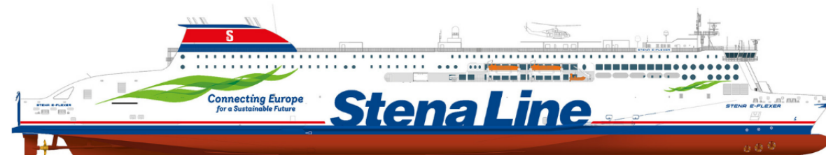
STENA ESTELLE (2022)

W0269 - LOA 214.5m - Pax 1,015 - Cabins 341 Lane metres 2,714 - LNG