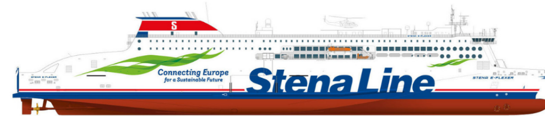
STENA EMBLA (2020)

W0267 - LOA 214.5m - Pax 1,015 - Cabins 340 Lane metres 3,054 - Scrubber