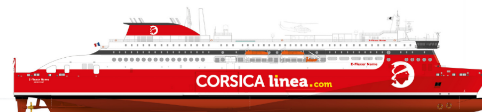
CORSICA LINEA TBN (2026)

W0275 - LOA 194.7m - Pax 1,310 - Cabins 222 Lane metres 2,219m trailers (+176Lm cars) Hybrid LNG Electric