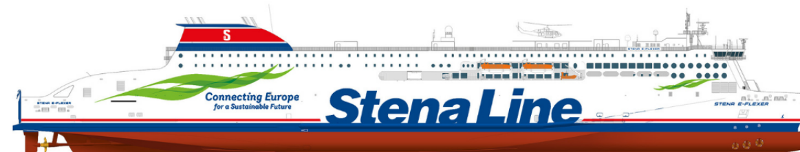
STENA EBBA (2022)

W0270 - LOA 240m - Pax 1,200 - Cabins 263 Lane metres 3,587