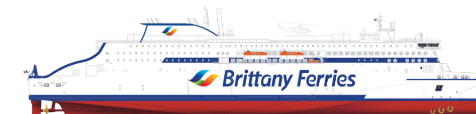
GUILLAUME DE NORMANDIE (2025)

W0278 - LOA 194.7m - Pax 1,290 - Cabins 387 Lane metres 1,143m trailers (+1,392Lm cars) Hybrid LNG Electric